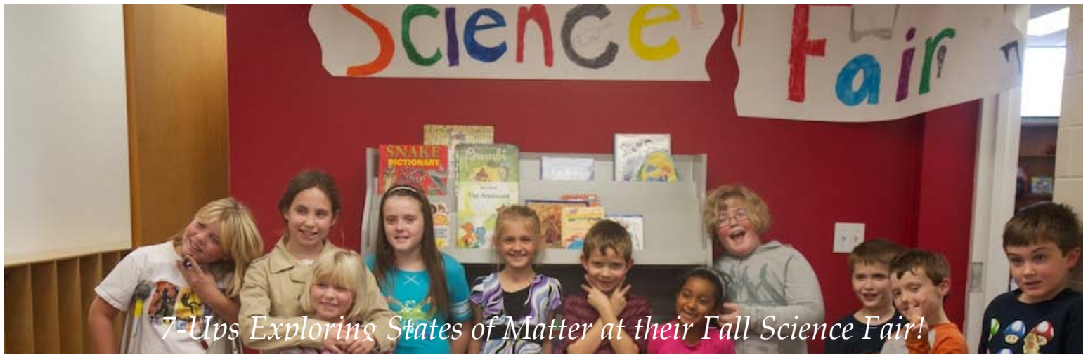
7-Ups Exploring States of Matter at their Fall Science Fair!